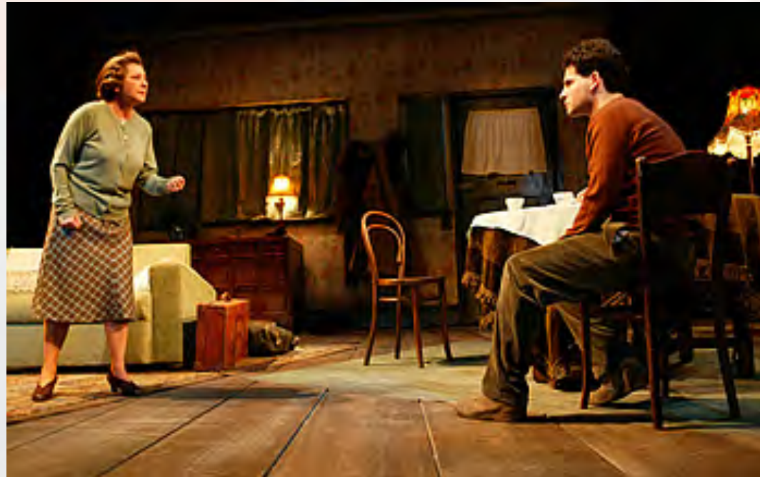
2011 Chicken Soup with Barley's production at the Royal Court Theatre

The full trilogy was performed at the Royal Court in 1960.